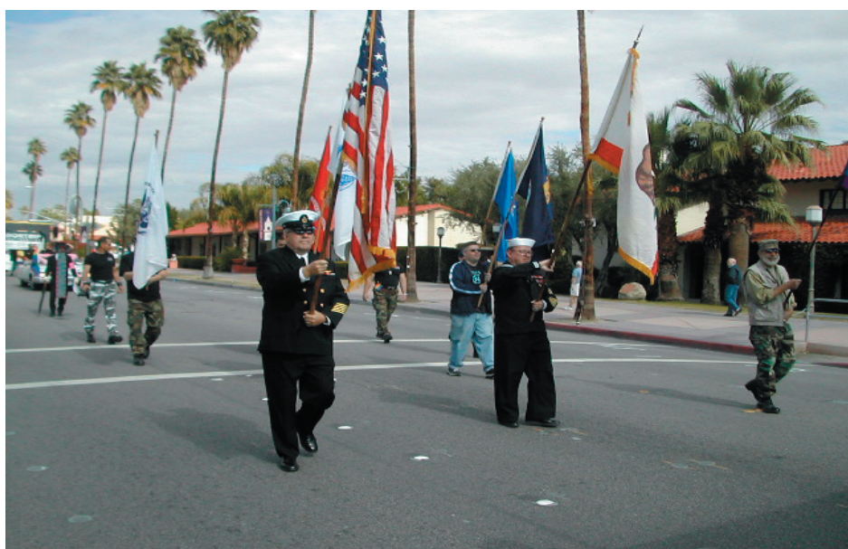
(left) Uniformed members of the Palm Springs Chapter proudly displaying their colors during the city's annual Pride Parade this past Fall.