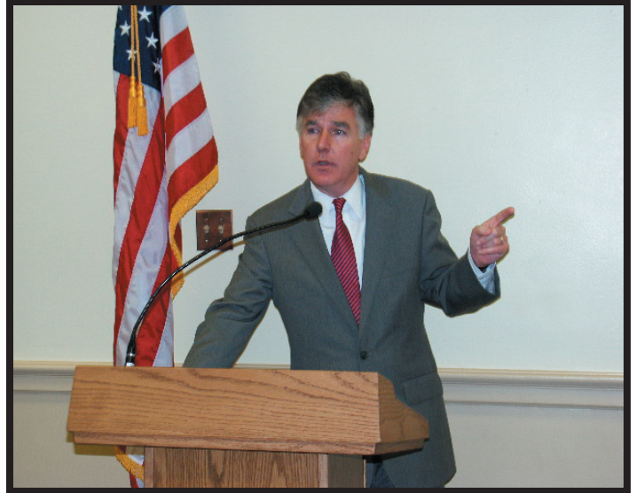
Congressman Meehan addresses the SLDN Lobby Day attendees