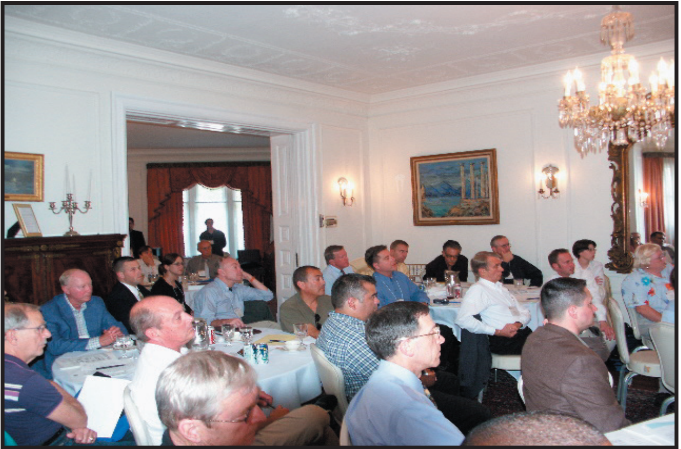
Attendees at last year's SLDN Lobby Days 101, in the mainfloor ballroom of the historic Women's Democratic Headquarters in Washington D.C.