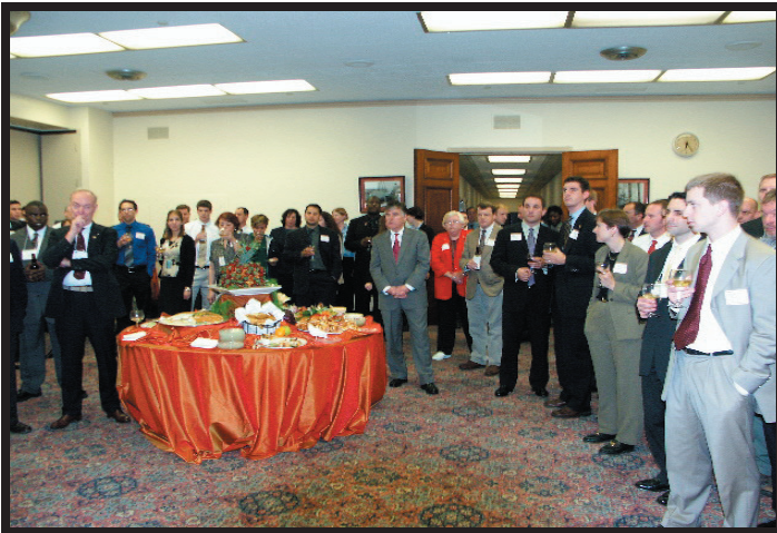
Weary Lobby Day attendees gather together in the Rayburn, House Office Building at the conclusion of Lobby Days