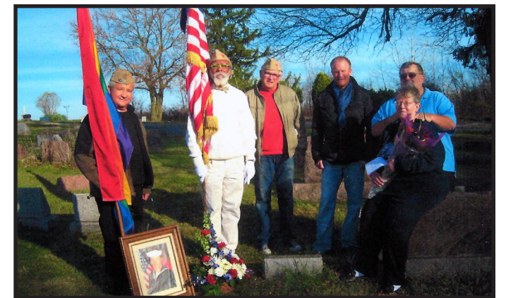
AVER Chicago holds 17th annual Allen Schindler Memorial Service