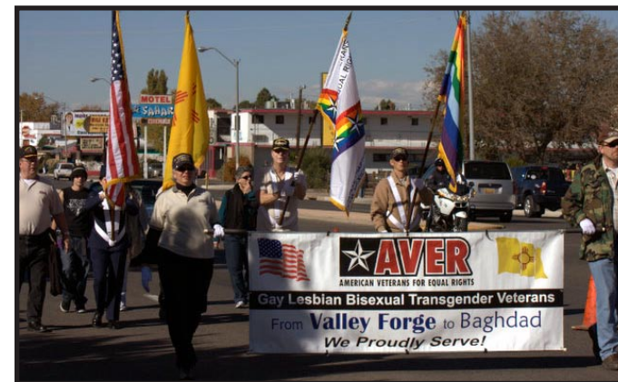
AVER Bataan (NM) members march in the 2010 Veterans Day Parade