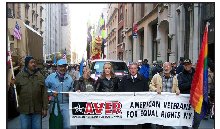
AVER-NY members march in the 2010 Veterans Day Parade

Save the date - 6-9 October 2011 - AVER National Convention - Albuquerque, NM